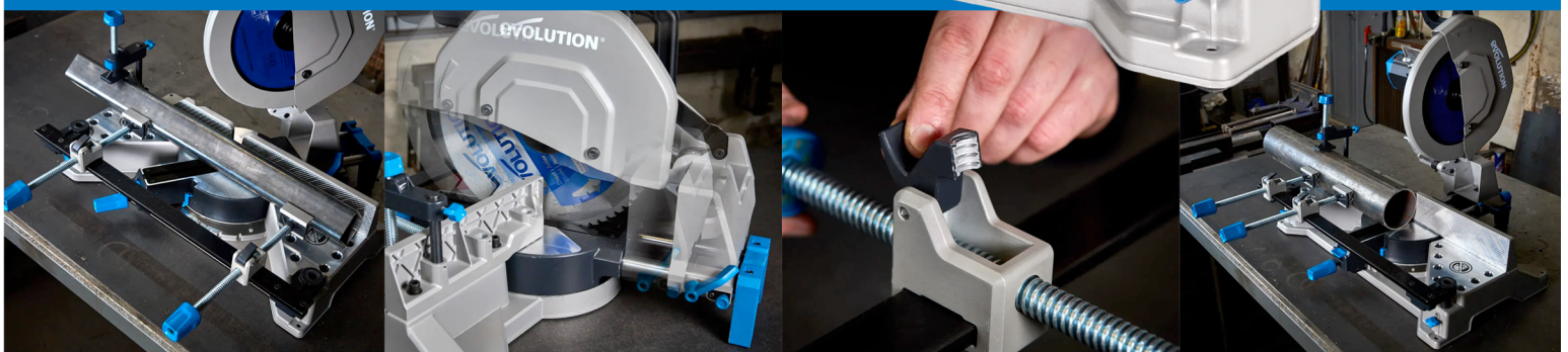
EASY BOX SECTION CLAMPING DUAL V-BLOCKS & TOP CLAMP LOCK IN ANY WORKPIECE